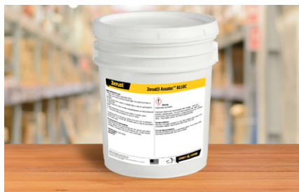
Targeted void space protection with ZERUST® corrosion inhibitors.

Axxatec™ 8110C is an aqueous-based additive for the protection of water-filled void spaces of hydraulic and coolant equipment.