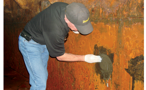
ZERUST® corrosion engineer in the field demonstrating a rust remover

For nearly 50 years, beginning with the invention of VCI film packaging, ZERUST®/EXCOR® has led the market in quality corrosion solution products. We are dedicated to providing expert corrosion management services and broadening the range of corrosion solutions for our customers. In addition, ZERUST® users have access to onsite support from ZERUST®/EXCOR® representatives in more than 70 countries. As a result, our customers have peace of mind when they choose ZERUST® for corrosion control management.