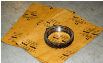
ZERUST® VCI Kraft Paper Sheets