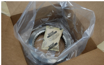
ZERUST® ActivPak® Diffusers