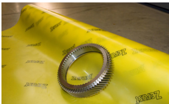
ZERUST® VCI Poly Film and Bags