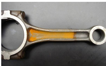
ZERUST® AxxaClean™ Rust Removers