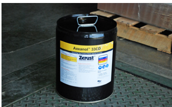
ZERUST® Rust Preventative Coatings and Additives