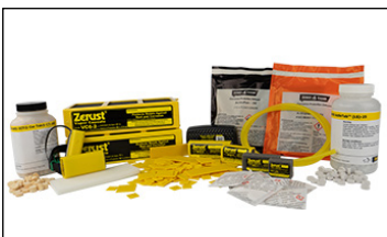
ZERUST® VCI Vapor Diffusers