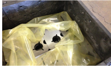
ZERUST® VCI Gusset Bag