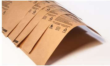
ZERUST® VCI Kraft Paper Sheets