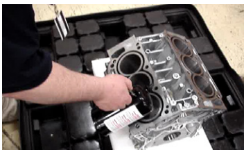
ZERUST® VCI Oil Spray-On RP