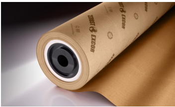
ZERUST® VCI Kraft Paper