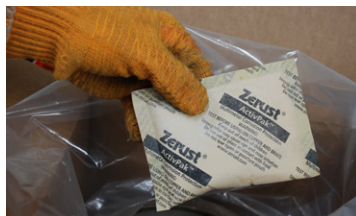
ZERUST® Fast-Acting ActivPak®