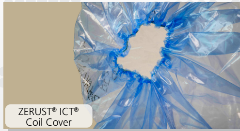
ZERUST® ICT® Coil Cover