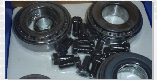
Bearings are protected in clear ZERUST® Skin Film